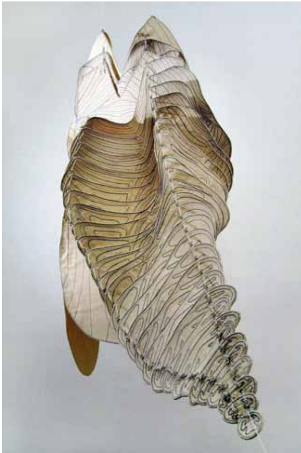
Breast layers, Anatomical garment XV, 2006, Cotton, 38 parts, 100cm height