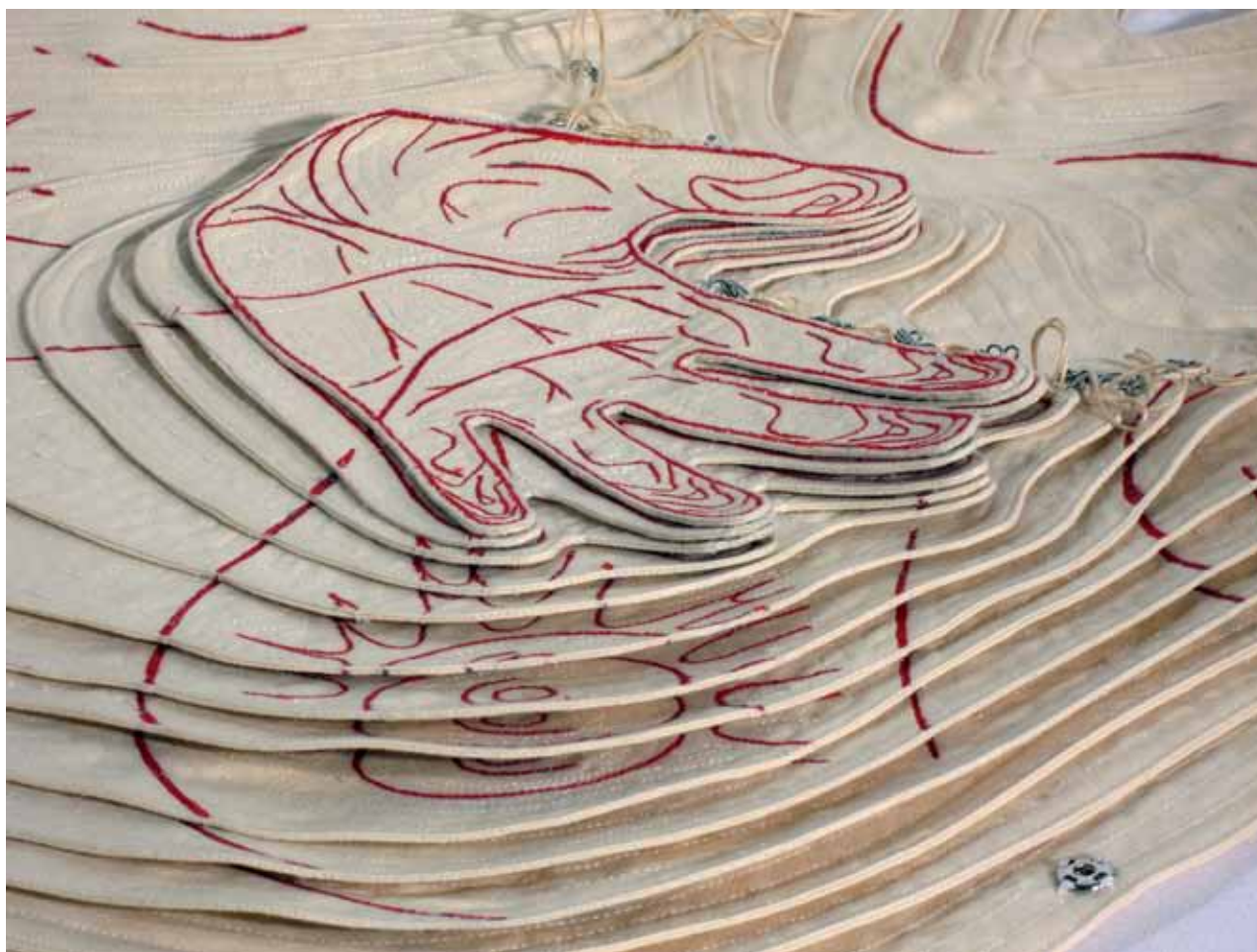
Hand breast layers , Anatomical Gatment XVI, 2008, Cotton, 90cm (Detailed) - Courtesy of the artist.