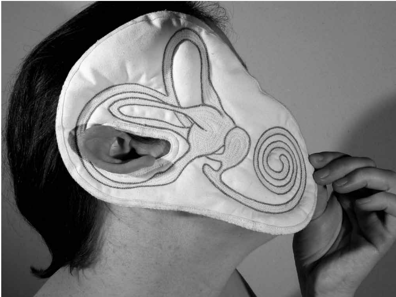
Ear object with bag , 2005, Cotton, 21x14,5x1.5cm

to numerous transformations and transfigurations. The manner in which she succeeds in interrelating the graphic and the spatial is striking. It seems that these works address that “sense of possibility” allowed by the aesthetic realm, where the limits of reality can be transcended and our conceptions of our body can be left up to fantasy. We cannot escape the body, but we can imagine it in a completely different form than that in which reality binds it. “My body, in fact, is always elsewhere. It is tied to all the elsewheres in the world. And to tell the truth, it is elsewhere than in the world, because it is around it that things are arranged. It is in relation to it – and in relation to it as if in relation to a sovereign – that there is a below, an above, a right, a left, a forward and a backward, a near and a far. The body is the zero point of the world. There, where paths and